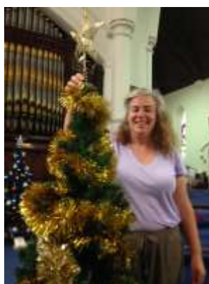
Two stars shining brightly