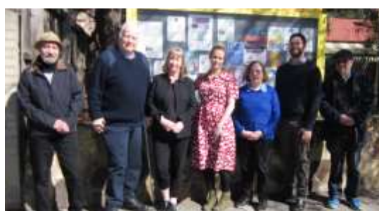
Unveiling of the new Community Notice board.

The House continues throughout 2018 with important partnerships and memberships to different peak bodies and organisations that have been strengthened over the years with other organisations, such as Galiamble, Elwood Toy Library, Elsternwick Estate, Emerald Hill Library, City of Port Phillip, City of Bayside, South Port Day Links (SPDL), Boomerang Bags, Elwood Community Choir, Port Melbourne Neighbourhood Centre, Port Phillip Community Group, Adult Community and Further Education (ACFE), Victorian Government, Australian Government, Elwood