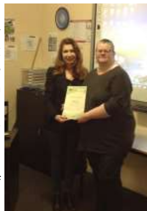
Graduation from ARCS

the participants have gone on to secure paid casual positions within our organisation. Congratulations to everyone involved in this program.