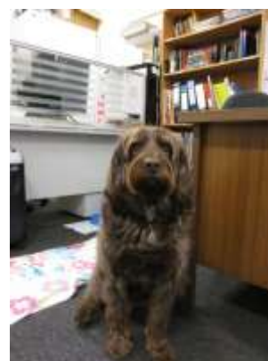
Woody the House dog!