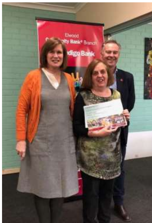
Committee members receiving funding cheque from Elwood Community Bank