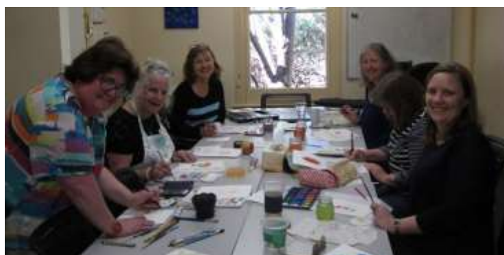
Community Workshop Series– Watercolours in action