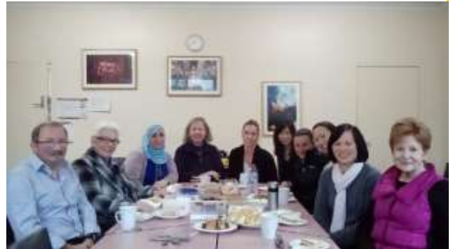
Beginners English on a Wednesday