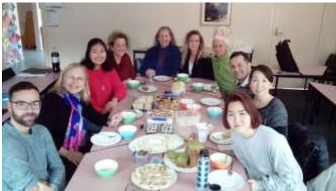
English as an additional language Intermediate class