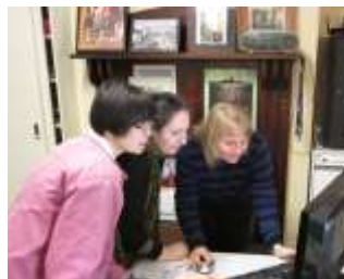
Learning on the Job

Again our successful Applied Reception and Customer Service [ARCS] course ran for