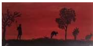
Artwork from Galiamble Indigenous Art therapy